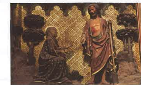
Christ and Mary Magdalene – relief from Notre-Dame cathedral in Paris

Easter is our opportunity to renew our faith and our commitment to Jesus and the teachings of the Gospel.